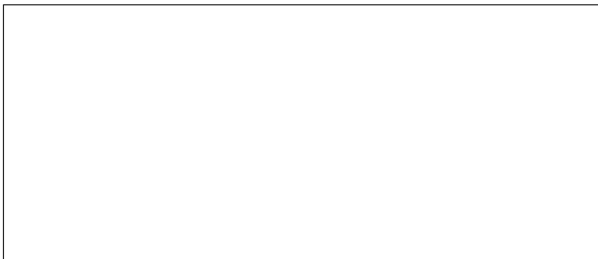
Figure 2. Radio HPLC chromatogram of reaction mixture of Ru-promoted 1,3-dipolar cycloaddition of ^{18}\text{F} HBIC with methyl 3-(4-(methylsulfonyl)phenyl)prop-2-ynoate, 10 min, 45°C; semi-preparative column, 50% MeCN/50% 0.1% TFA (v/v), flow 5 mL/min