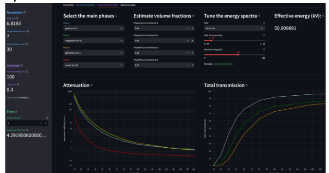
Figure 1. (a) Scheme of a step-by-step protocol to plan CT experiments. The steps can be followed using an open source GUI (b).